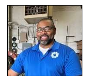
Meknology at Newlab