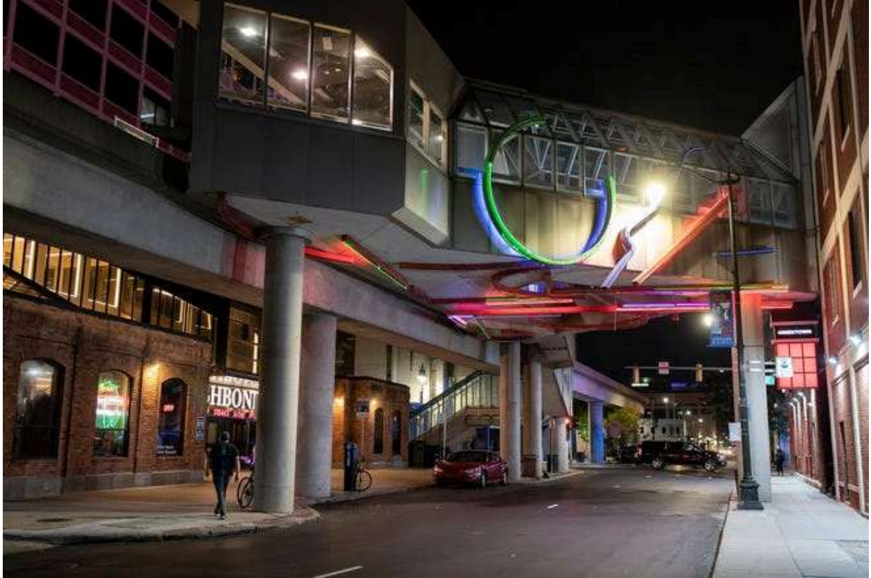
The Greektown streetscape, as pictured on Wednesday, Oct. 4, 2023, has recently undergone a major renovation.