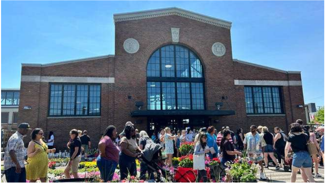
Thousands attend Flower Day at Eastern Market , May 27, 2026.