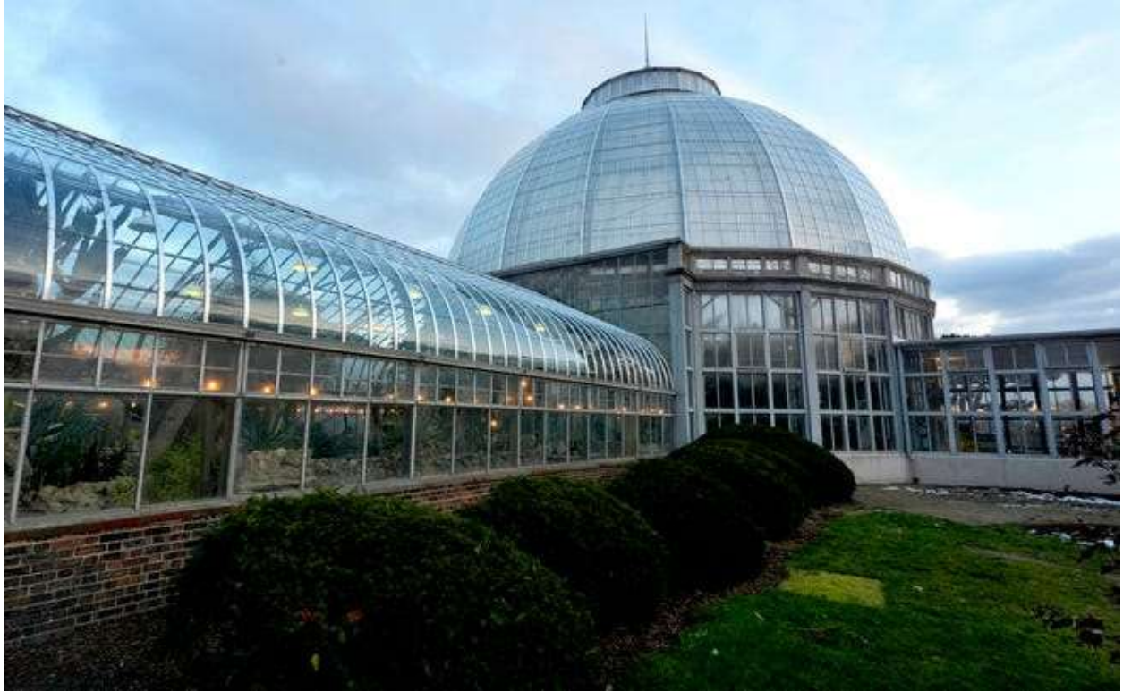
An exterior of the renovated Anna Scripps Whitcomb Conservatory on Belle Isle in Detroit on Tuesday, Dec. 3, 2024.