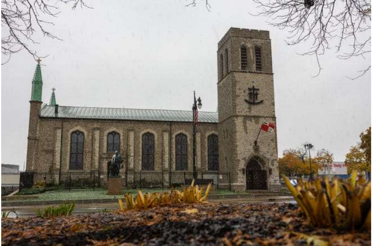
Mariners' Church of Detroit , best known for its connection to Great Lakes sailors, this downtown church is instantly identifiable to locals.