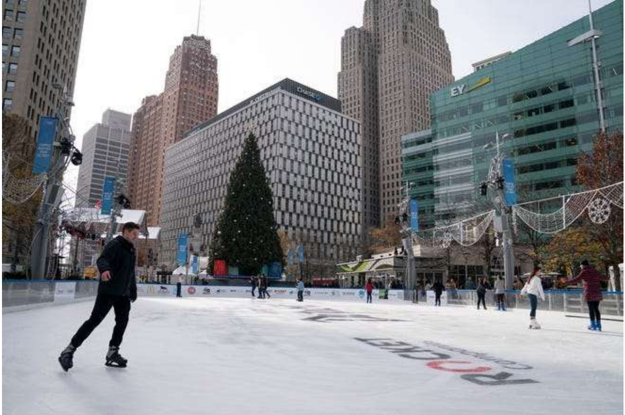
Campus Martius Park in Detroit on Thursday, Nov. 16, 2023.