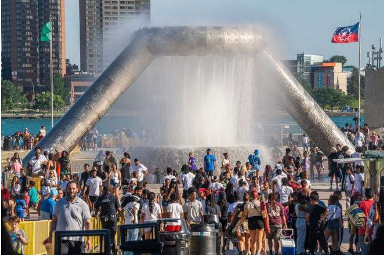
People gather in Hart Plaza near the Dodge Fountain prior to the 2025 Ford Fireworks in Detroit on Monday, June 23, 2025.