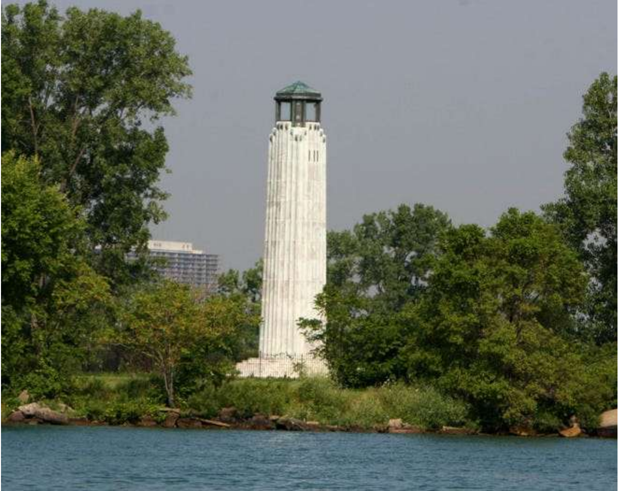
The William Livingstone Memorial Lighthouse on the eastern end of Belle Isle in Detroit. It is made of marble.