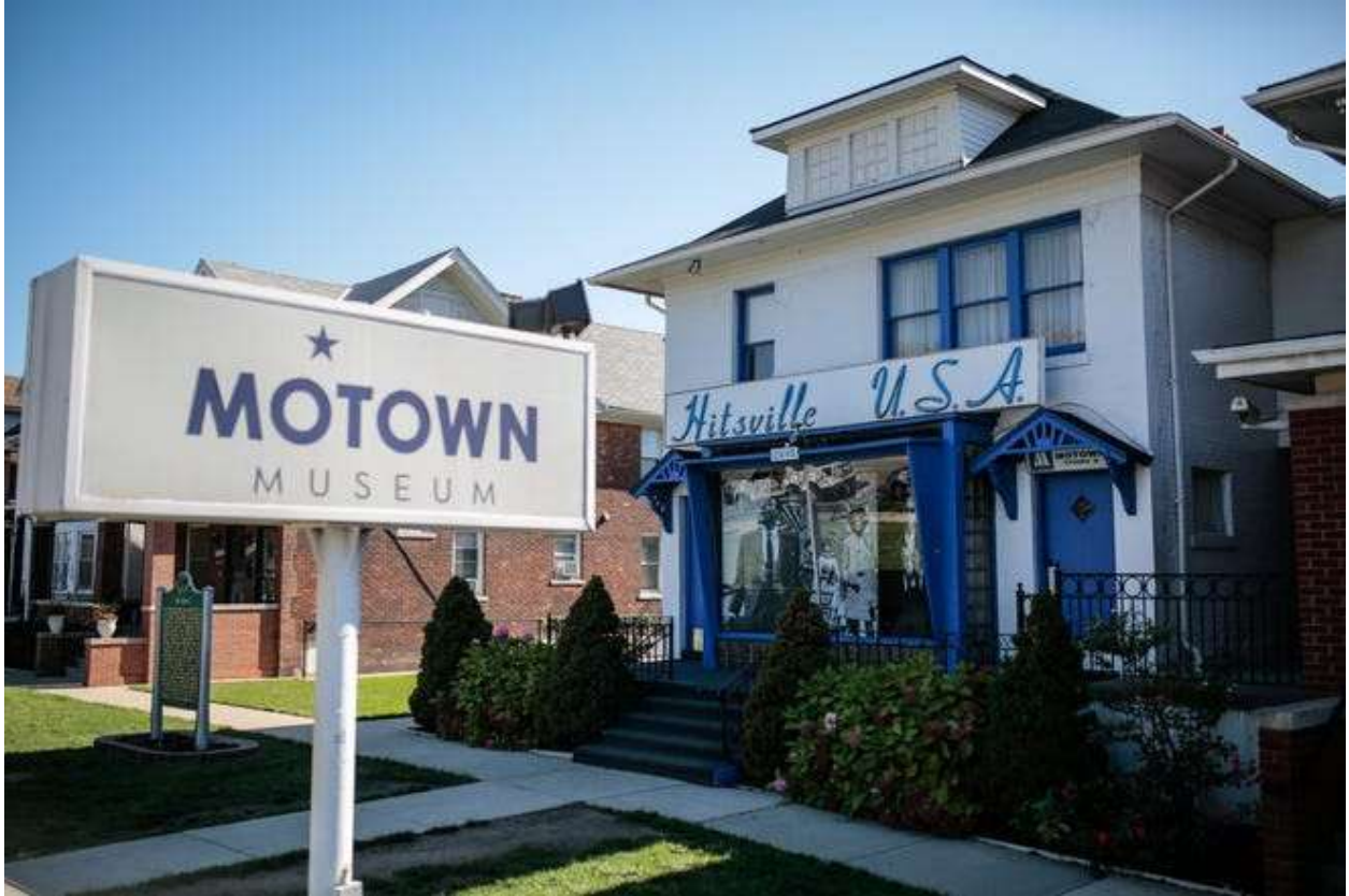
A sign for Hitsville U.S.A. and the Motown Museum are seen in Detroit on Friday October 20, 2017.