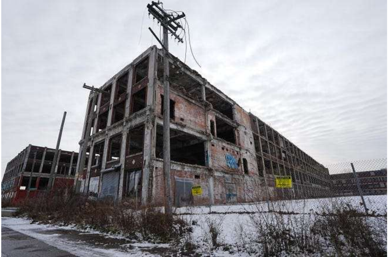
The Packard Plant on the east side of Detroit, Monday, Dec. 1, 2025.