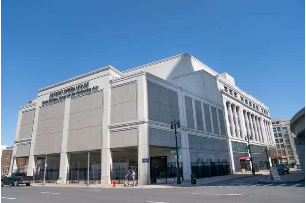
The Detroit Opera House photographed on Monday, April 15, 2024.