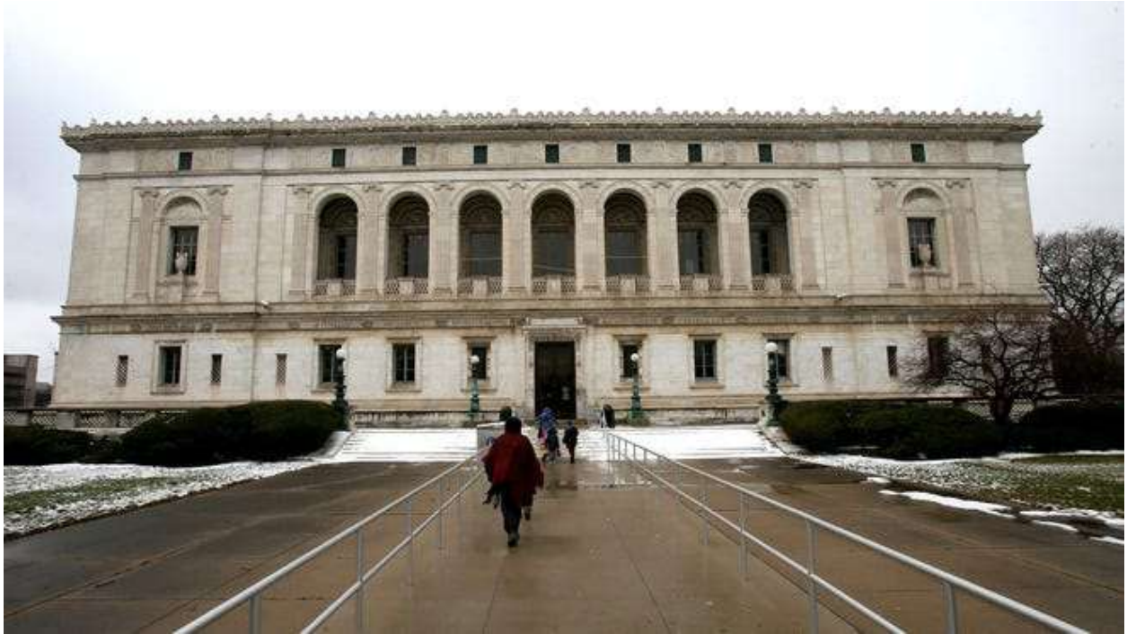
The main branch of the Detroit Public Library on Woodward Avenue in Detroit on Saturday, March 18, 2017.