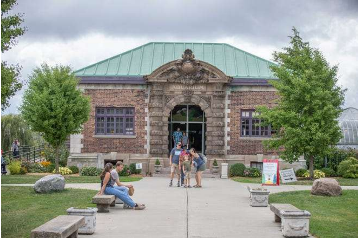
Belle Isle Aquarium on Sunday, Aug. 21, 2022.