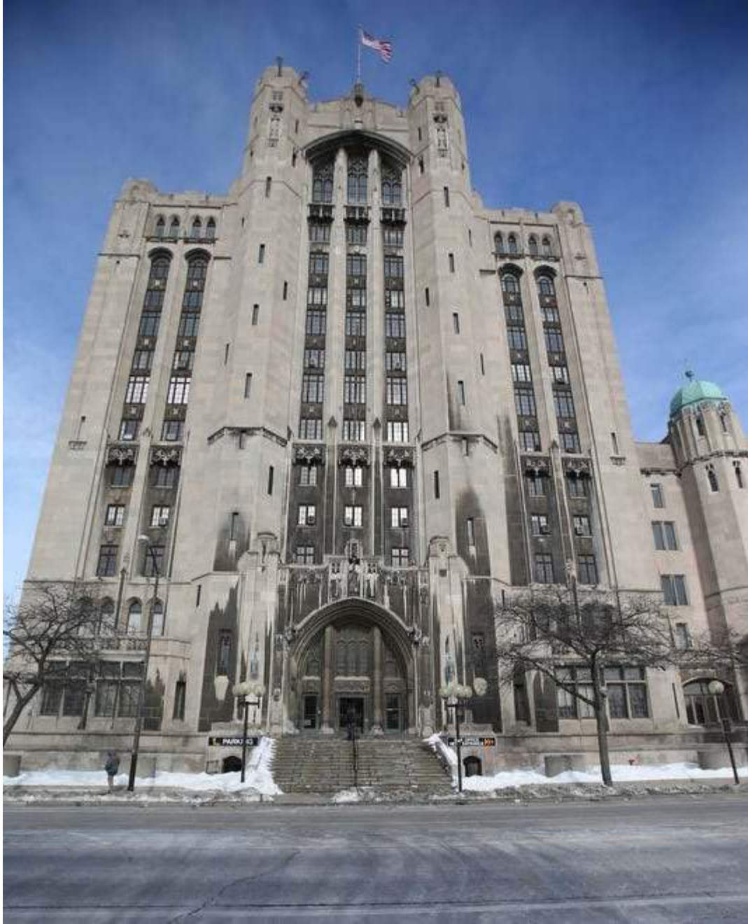
Exterior of the Masonic Temple in Detroit on Friday, February 13, 2015.