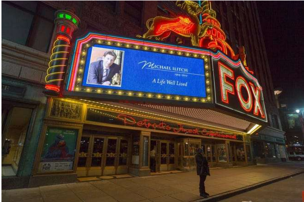
Mike Ilitch is remembered on the marquee of the Fox Theater on Friday, Feb. 10, 2017 in downtown Detroit.