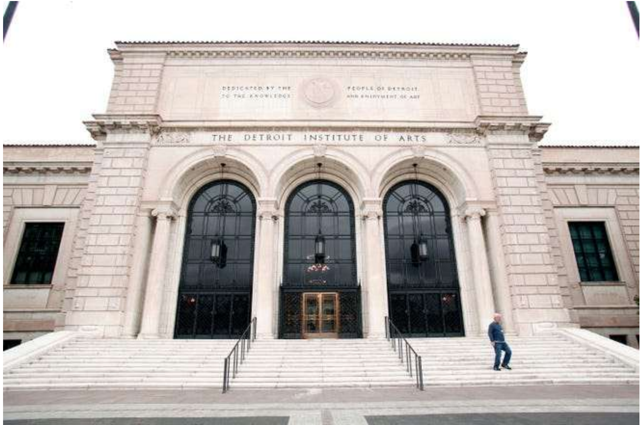
The exterior of the Detroit Institute of Arts is shown July 16, 2014 in Detroit, Michigan.