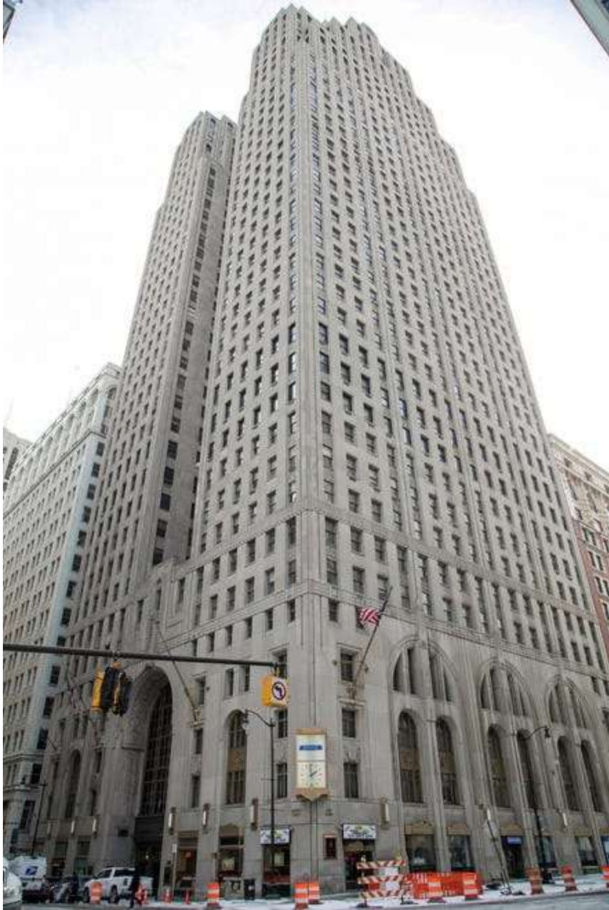
The Penobscot building in Detroit photographed Monday, Feb. 8, 2021.