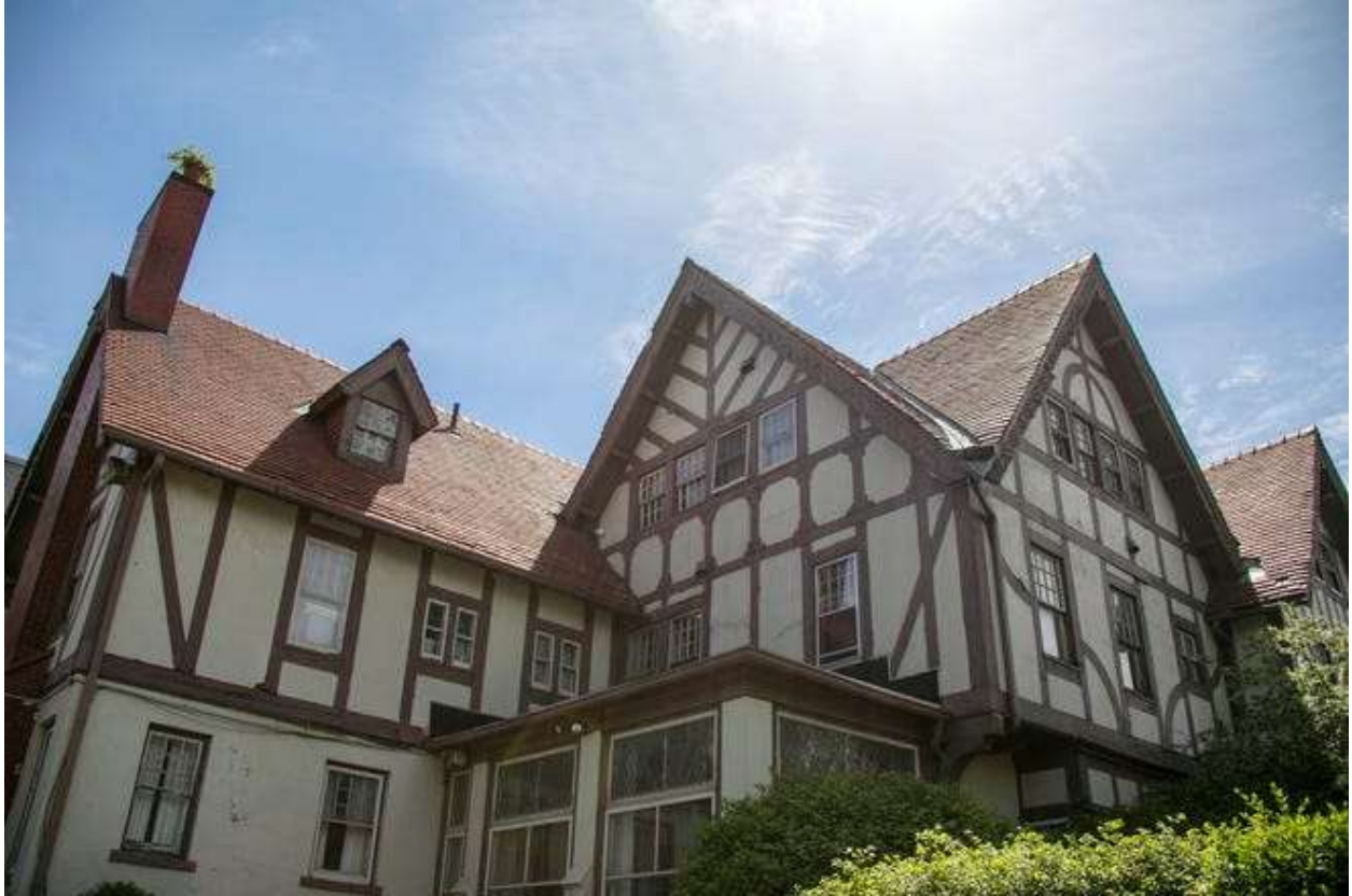
Pewabic Pottery / Pewabic's Tudor-style studio — the building itself is distinctive, and it carries deep Detroit craft history.