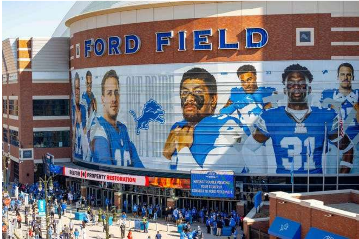
A general view of the exterior of Ford Field stadium as fans arrive prior to the game between the Chicago Bears and the Detroit Lions at Ford Field.