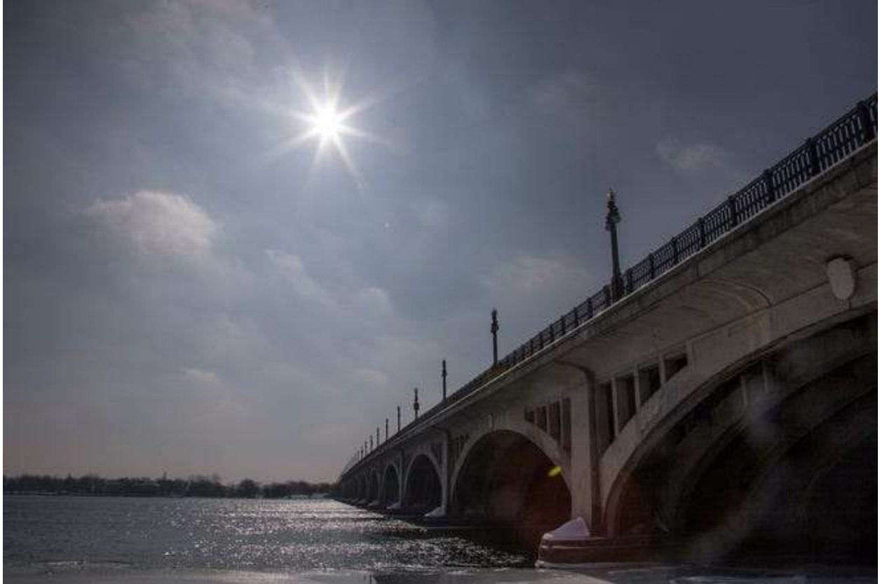
The MacArthur Bridge is a long-standing connector to Belle Isle.