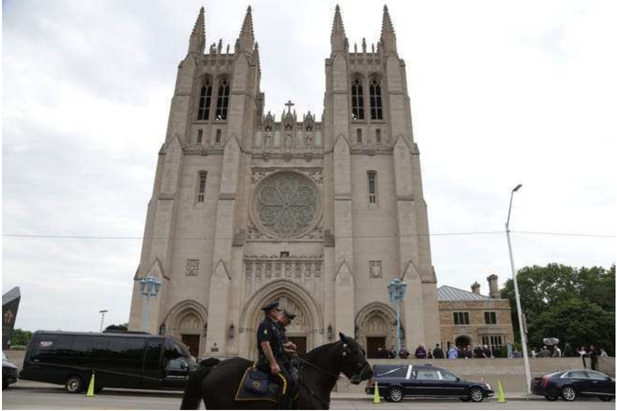
The Cathedral of the Most Blessed Sacrament in Detroit on Wednesday, June 15, 2016.