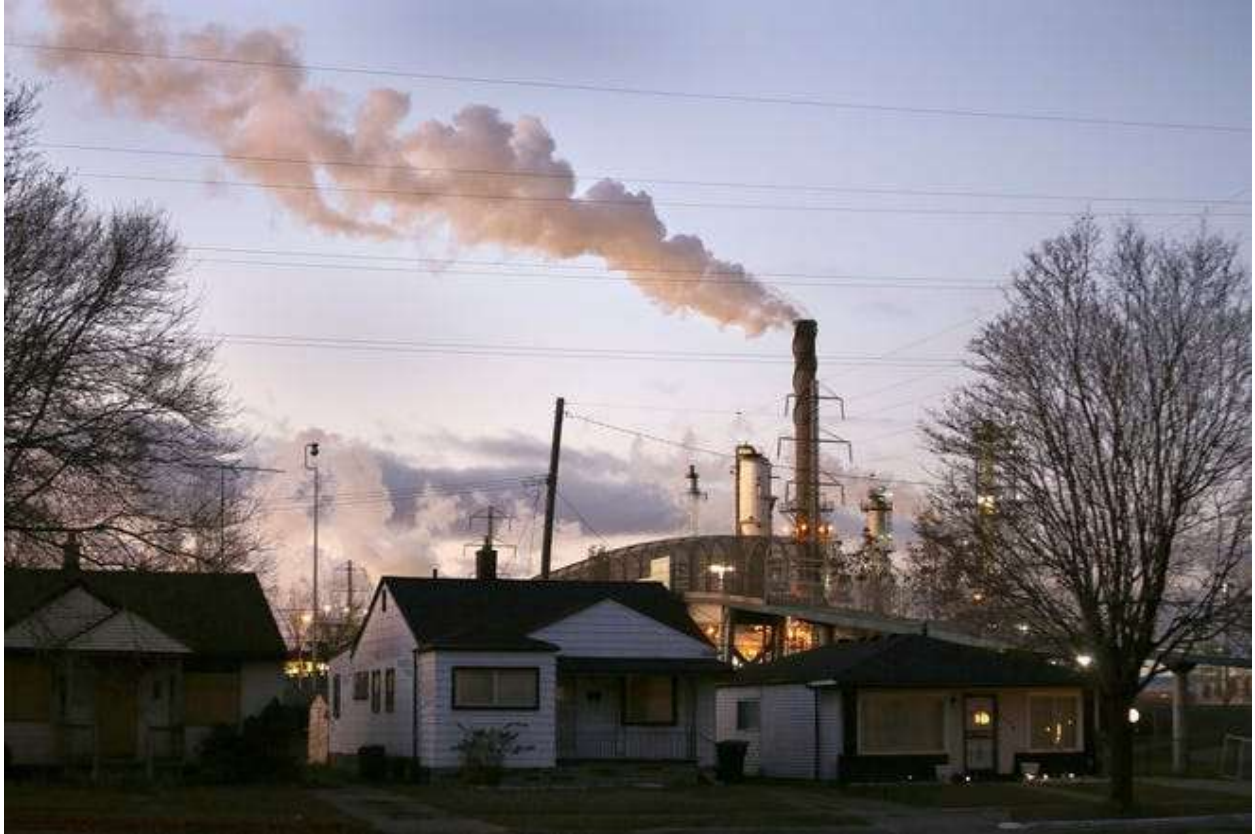
Marathon Petroleum Refinery in southwest Detroit.